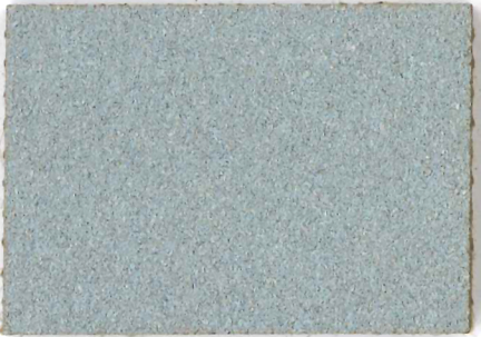
2162 | duck egg NCS 5005 - B80G LRV 25%