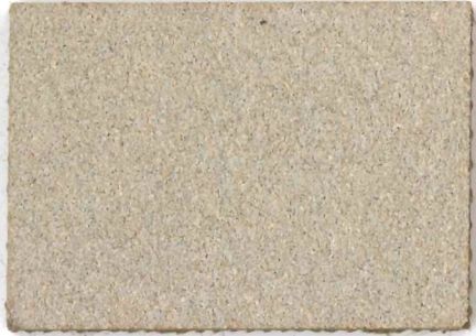
2182 | potato skin * NCS 4005 - Y20R LRV 28%