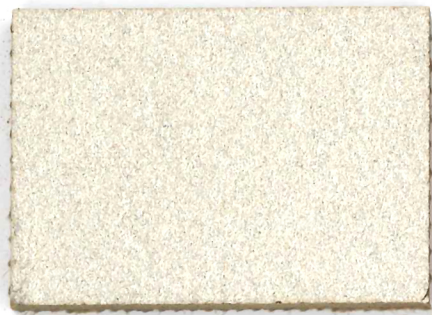
2206 | oyster shell NCS 3502 - Y LRV 43%