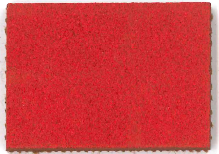
2210 | hot salsa NCS 3560 - Y90R LRV 11%