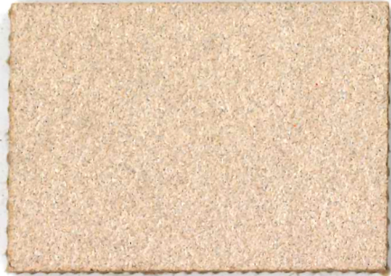
2187 | brown rice NCS 4010 - Y30R LRV 34%