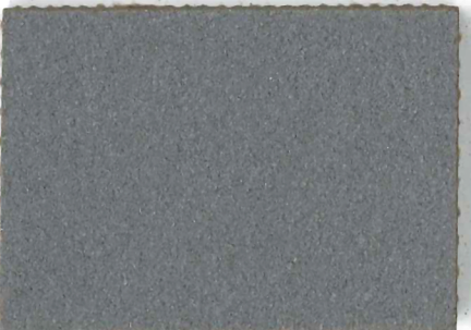
2204 | poppy seed NCS 6500 - N LRV 16%