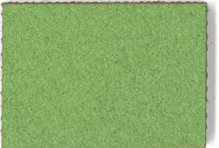
2213 | baby lettuce NCS 4030 - G30Y LRV 23%