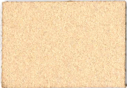
2186 | blanched almond * NCS 3020 - Y20R LRV 34%