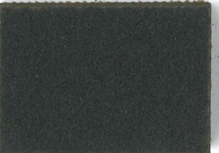
2209 | black olive NCS 9000 - N LRV 5%