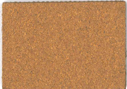
2166 | nutmeg spice * NCS 4030 - Y30R LRV 22%