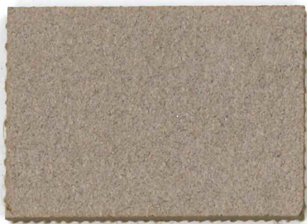
2208 | mushroom medley NCS 5005 - Y50R LRV 21%