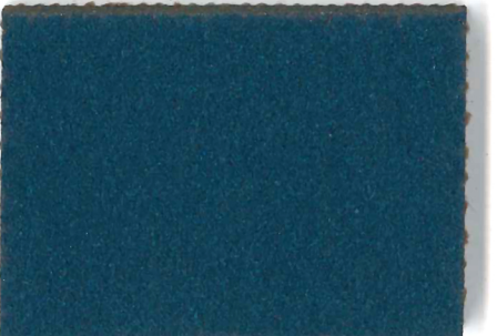
2214 | blue berry NCS 6030 - B LRV 6%