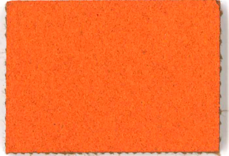
2211 | tangerine zest NCS 2070 - Y60R LRV 20%