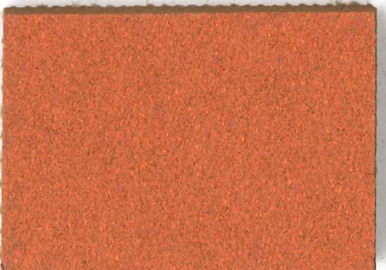
2207 | cinnamon bark NCS 4040 - Y50R LRV 18%