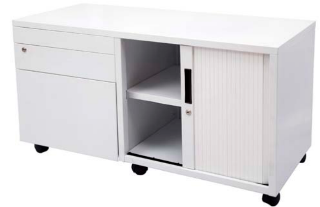
GMP3 - 3 Drawer Mobile Pedestal, 2 Drawer, 1 File