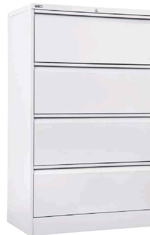
GLF4 - 4 Drawer Lateral Filing Cabinet

Cubic Metres: 0.47 Weight: 58kg No. of Boxes: 1