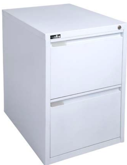
RFC2 - Flat Pack Rapidline 2 Drawer Filing Cabinet