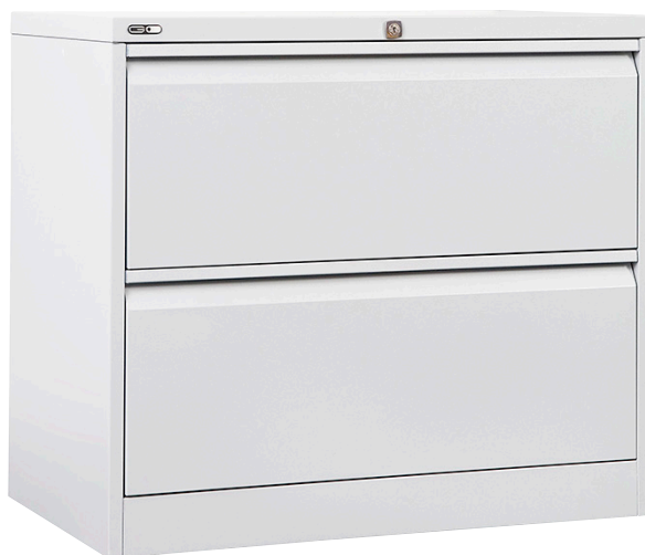
GLF2 - 2 Drawer Lateral Filing Cabinet