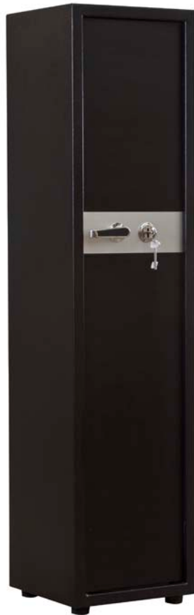
503-5GUNK 5 Gun Safe with Key Lock