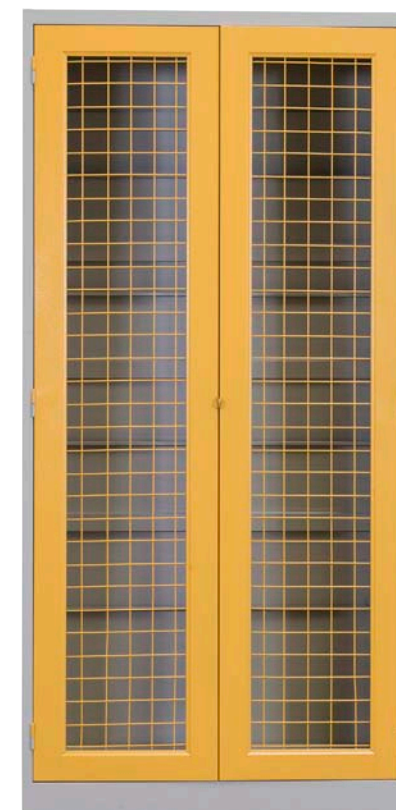
COLOURS Yellow Mesh