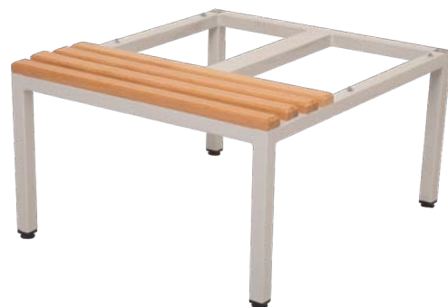
S+S2305 - Seat and Stand For Bank of 2 x 305W Lockers Silver Grey only.