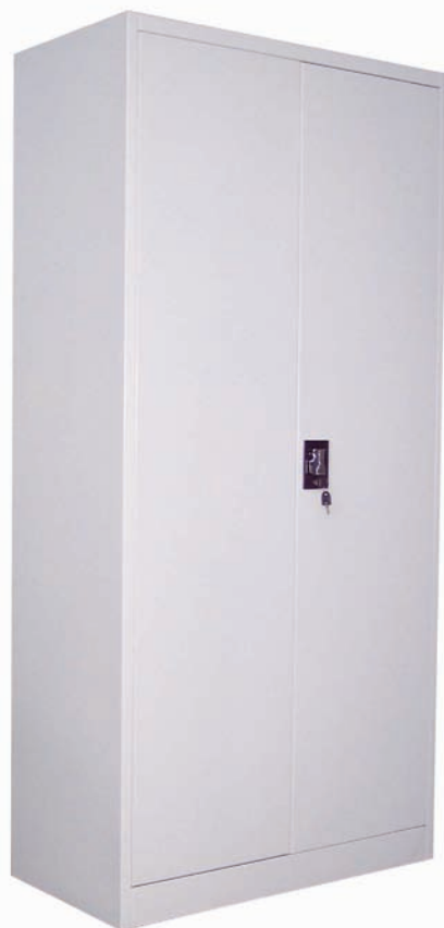
COLOURS Grey Ripple