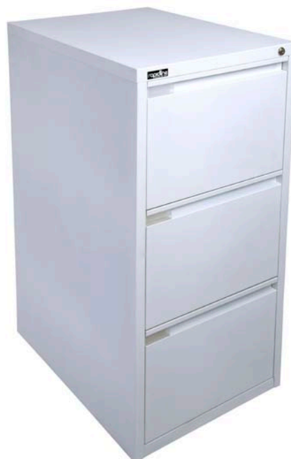
RFC3 - Flat Pack Rapidline 3 Drawer Filing Cabinet

Cubic Metres: 0.047 FP / 0.21 A Weight: 24kg No. of Boxes: 1