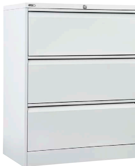
GLF3 - 3 Drawer Lateral Filing Cabinet

Cubic Metres: 0.329 Weight: 42kg No. of Boxes: 1