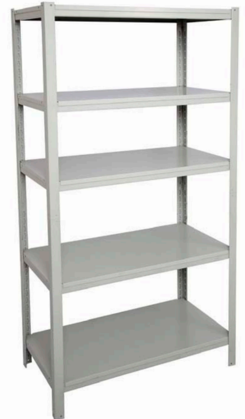
GV1812 - Boltless Shelving Unit