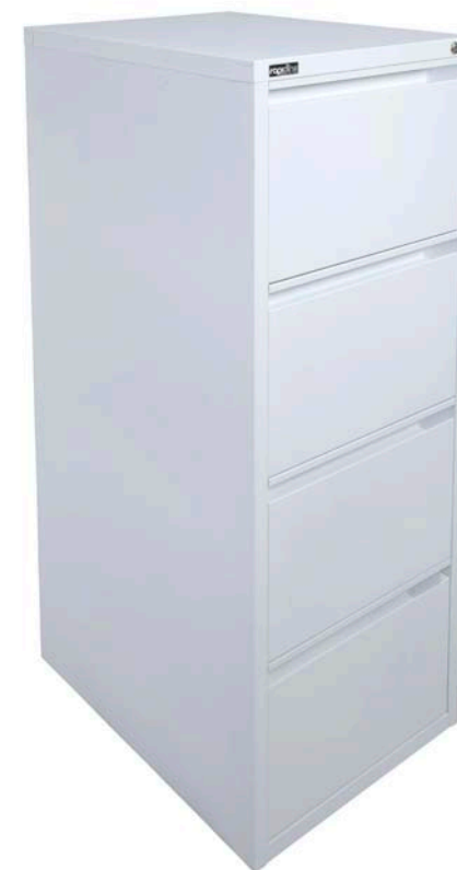
RFC4 - Flat Pack Rapidline 3 Drawer Filing Cabinet

Cubic Metres: 0.065 FP / 0.32 A Weight: 32kg No. of Boxes: 1