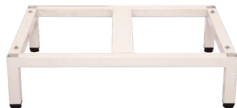
S+S3305 - Seat and Stand For Bank of 3 x 305W Lockers Silver Grey only.