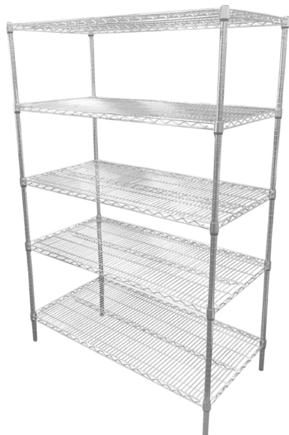
SWB181245C - Chrome Wire Shelving - 5 Levels 1800mm H x 1200mm W x 450mm D