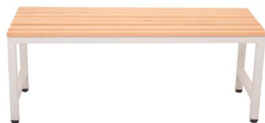
BS1000 - Bench Seat 1000mm Wide Bench Seat in Silver Grey only.