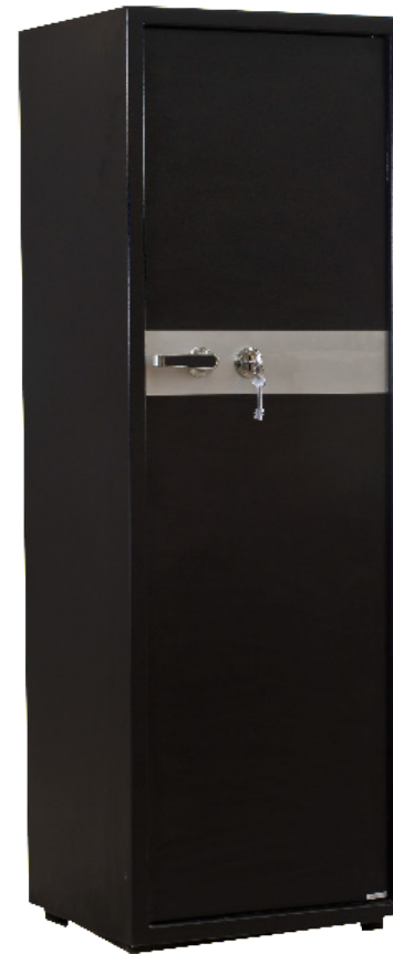
503-10GUNK 10 Gun Safe with Key Lock